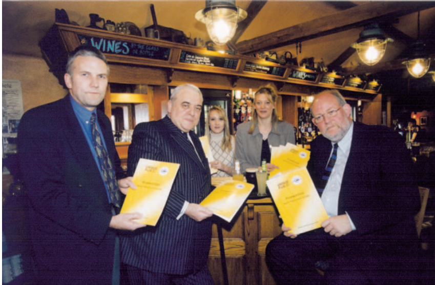
Home Office Minister Charles Clarke MP launches pubwatch across the Unique Pub Company's estate (see page 4)